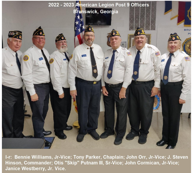
2022 - 2023 American Legion Post 9 Officers Brunswick, Georgia

In the newsletter, we have Family Members in Service and on the Prayer List that need to be updated. Either by adding, deleting, or changing the contents.