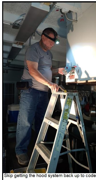
Skip getting the hood system back up to code

The past 10 months have surprise. Get one thing done its head out of the water. let's see we went to have our system in the kitchen and fire and behold the hood system extinguishers were too old to years old was a good run! system was being replaced. things up to code during the bingo they didn't get to serve the famous french fries.